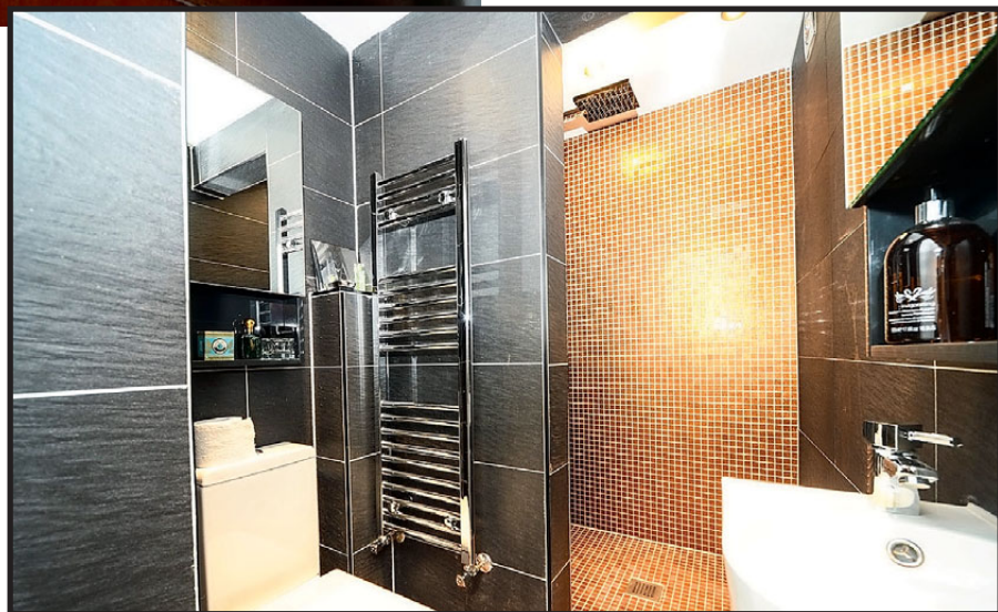
Retro meets contemporary: The lounge channels a midcentury vibe while the splashes of colour in the kitchen and bathrooms suit a vibrant family life

an asset to interior design, using old birthday presents as accessories. Getting the whole family involved, she even had their four-year-old son scribble his name on old pictures to give them an 'artisan' quality. The couple's eclectic taste can be seen everywhere – from the orange flooring in the kitchen (which initially elicited quite an adverse reaction from friends and family, but they have since revised their opinions to 'that's kind of fabulous'), to the Art Deco mirrors from Crystal Palace Antiques & Modern, their house is an amalgamation of modern concerns and stylish personality. ➡